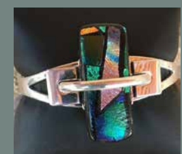
Karen Melody Shatar Jewelry

April Art on Exhibit 4/13/2024 to 5/4/2024