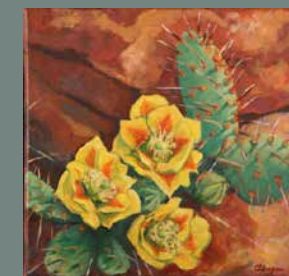
Colleen Gregoire Oil & Water Color